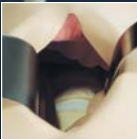
View without LightMat