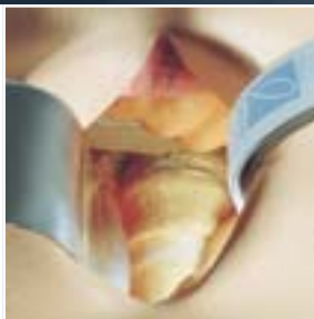
View with LightMat

“We all know that traction/counter-traction and visualization are the keys to success in surgery. This LightMat makes visualization so much easier in deep cavities. I find it saves significant time and ultimately leads to safer, more efficient surgery.”