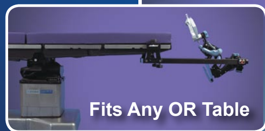
Fits Any OR Table